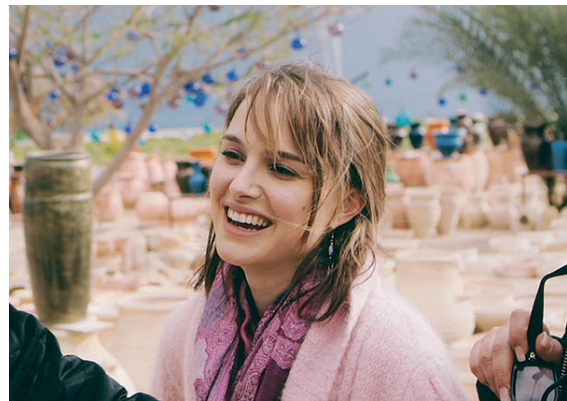
On the set of Free Zone , 2005

After filming Where the Heart Is , Portman moved into the dorms of Harvard University to pursue her bachelor’s degree in psychology. [20] She said in a 1999 interview that, with the exception of the Star Wars prequels, she would not act for the next four years in order to concentrate on studying. [62] During the summer break from June to September 2000, Portman filmed Star Wars: Episode II – Attack of the Clones in Sydney, along with additional production in London. [63]