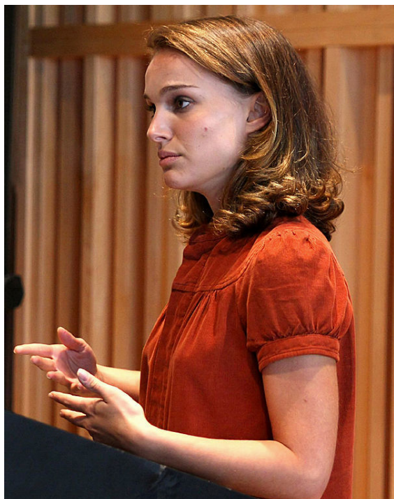
Speaking about her work with global microfinance organization, FINCA International at Columbia University in 2007

joined an environmental song and dance troupe known as World Patrol Kids. She is also a member of the One Voice movement. [107]