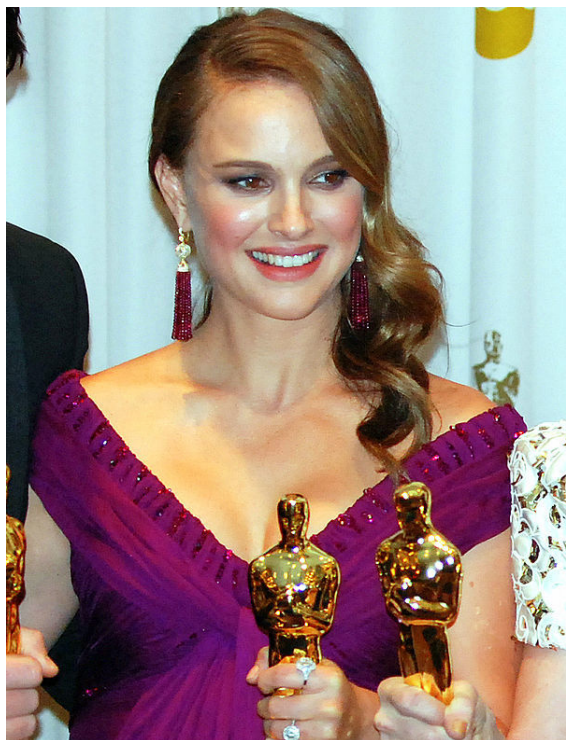
Holding her Oscar at the 83rd Academy Awards, 2011

After starring in the video for his song “Carmensita”, she began a relationship with folk singer Devendra Banhart, [122] which ended in September 2008. [123]