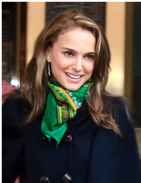
At the 2009 Toronto International Film Festival

The final Star Wars prequel, Star Wars: Episode III – Revenge of the Sith , was released on May 19, 2005. The film was the highest grossing domestic film of that year [67] and was voted Favorite Motion Picture at the People’s Choice Awards. Also in 2005, Portman filmed Free Zone and director Miloš Forman’s Goya’s Ghosts . Forman had not seen any of her work but thought she looked like a Goya painting, so he requested a meeting. [68]